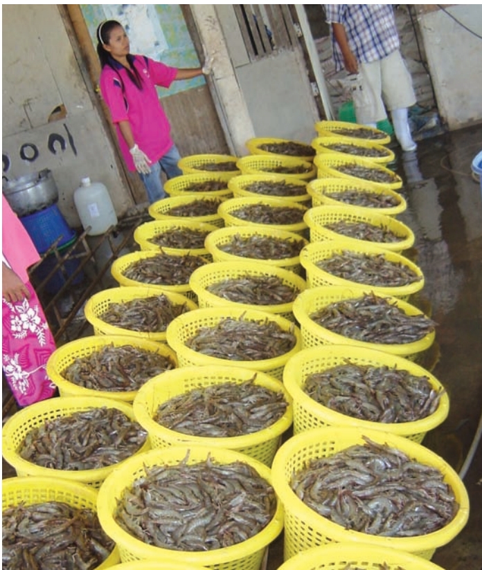
Thailand's move to P. vannamei resulted from the species' higher profit potential and production reliability through the avoidance of disease.

Since 2001, P. monodon farmers have faced a new disease called Monodon Slow Growth Syndrome (MSGs), which is characterized by slow growth that leads to small harvest sizes and lower prices. The cause of MSGs is still unknown. This slow growth problem with P. monodon set the stage for the introduction of specific pathogen-free (SPF) P. vannamei . Farmers were looking for a lower-risk, reliable way to make money farming shrimp.